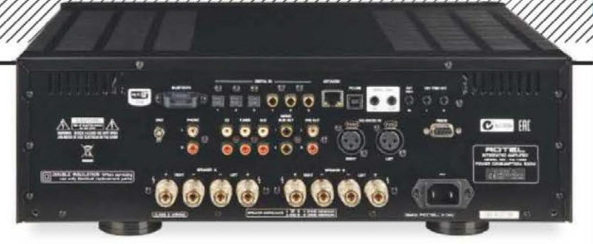
ABOVE: Four line (one on XLR) and MM ins are joined by sub and preamp outs plus pairs of switched 4mm speaker cable terminals. Digital ins include Bluetooth, S/PDIF (three optical, three coax) and asynchronous USB. Note RS232 and Ethernet IP control

Gustavo Dudamel's self-released download-only album of Wagner with the Simón Bolívar Symphony Orchestra of Venezuela [48kHz/ 24-bit via Qobuz], where the amp manages to deliver all the richness of the music without smothering the finer details of the score, then lets rip with that characteristic brass and percussion to dramatic effect.