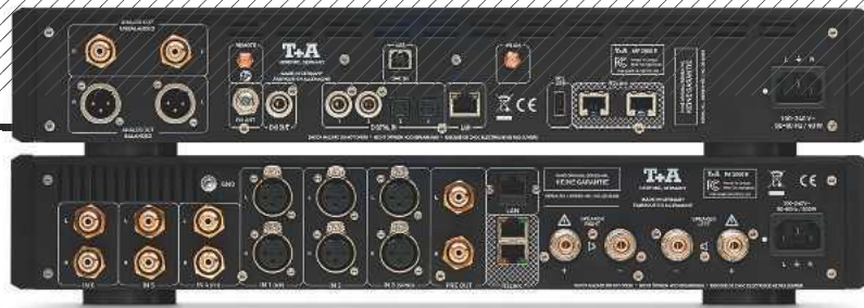
ABOVE: A plethora of digital connectivity – two coax and two optical S/PDIF, wired and wireless LAN, USB A and B plus balanced XLR and single-ended RCA outs. The amp [below] offers three RCA and three balanced XLR ins, pre and 4mm speaker outputs

appearing rich in tonal subtlety and textures, with lovely ‘dark’ space around all the instruments.