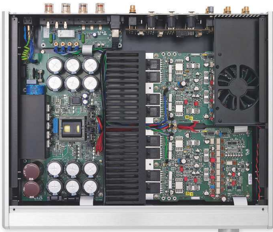
RIGHT: Exquisitely designed and laid out – with level-dependent forced air cooling – the PA 2000 R combines an efficient switchmode PSU with a derivation of T+A's 'High Voltage' amplification

Meanwhile the almost-all-encompassing MP 2000 R might be considered a substantially scaled-down version of T+A's £8300 MP 3000 HV media player [HFN Jun '13] amalgamated with the DSD-capable USB technology debuted in the company's £11,670 PDP 3000 HV disc player/DAC [HFN Mar '15]. At this MP's heart lies T+A's sophisticated re-clocking regime with four pairs of Burr-Brown 384kHz/32-bit