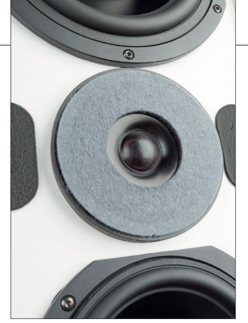
It looks like a dome, but it is in fact a very special cone high tweeter with exquisite sound characteristics

n the 30th anniversary of the company. Audio Physic presented the jubilee Avanti, which is a milestone and a classic in the company's history. As we remarked in the test featured in our 3/2016 edition, the new version has only the basic shape in common with the old Avanti - a slender, slightly reartilted standing cabinet, with the midrange and tweeter chassis facing the front. The larger Codex adheres to the same principles, only with one additional driver on - or rather: behind the glass baffle. The additional low-midrange driver is mounted above the tweeter, the Codex is a grown-up Avanti, so to speak - naturally it is also somewhat wider and more voluminous as a result. Overall, however, despite the larger cabinet in all dimensions, the result is