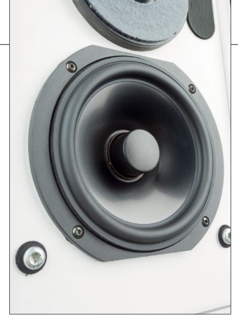
On the smaller of the two mid-range drivers, you unfortunately cannot see the dual-basket design from the outside

still a slender and elegant loudspeaker. Customers have a choice, by the way, between having the cover of the front chassis in the cabinet color or accentuated in black. There is generally a wide range of colors available – and with glass as the cover material, you have one surface finish anyway, which looks stylish, is extremely robust and very easy to care for – if necessary, by the window washer.