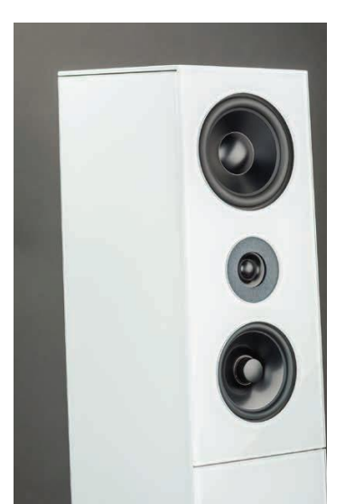
The cover, which comes in the same color, sets the Codex apart from the technical look

» A loudspeaker featuring modern and consistent design in all the details, performing exceptionally well and offering truly stunning bass reproduction even in large rooms. «